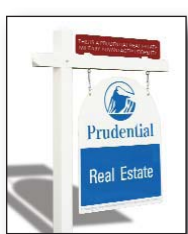
Yard Sign Rider